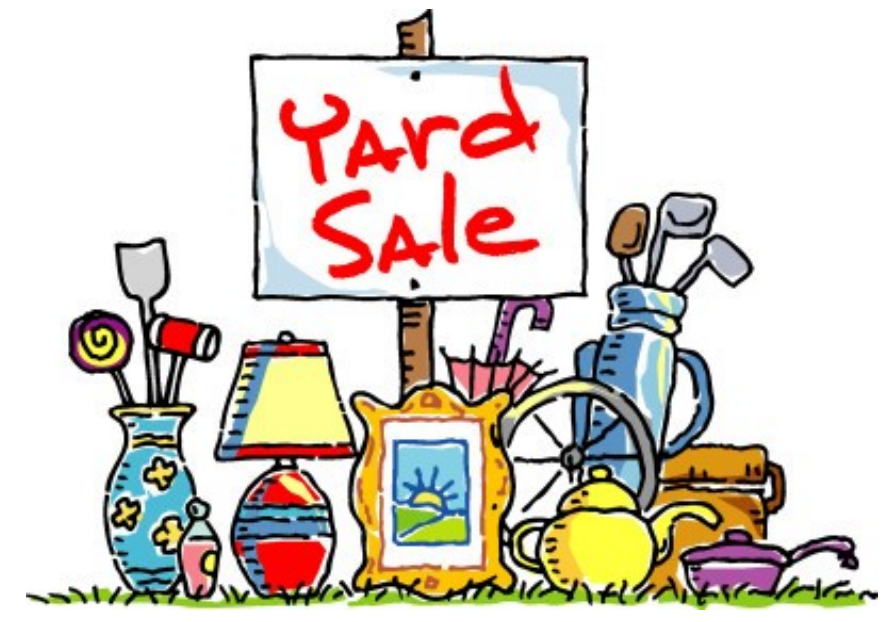
TABB LAKES ANNUAL YARD SALE SATURDAY, MAY 20