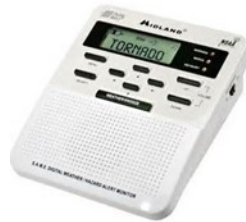
Get a NOAA Weather Radio

For more information about Tornadoes and Tornado Safety visit the following links: VDEM Tornado Safety Tips: http://www.vaemergency.gov/prepare-recover/threat/tornadoes/