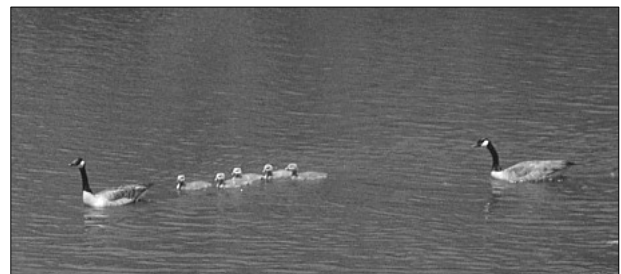
Goslings about 2 weeks old with their parents!