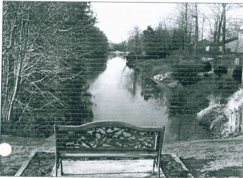
It's hard to believe with the temperatures now, but soon the cool breezes of autumn will be upon us -- perfect for sitting back and enjoying the outdoors in Tabb Lakes.