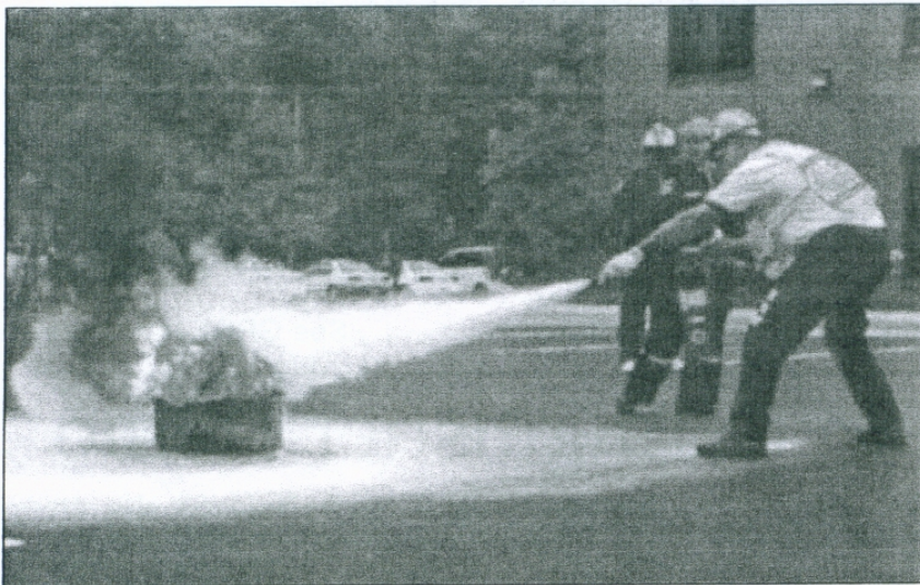
Come see a fire extinguisher demonstration Sept. 10 at 10 a.m. between the lakes.

Thanks to Dan - and to everyone else in the neighborhood who have served our country.