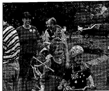
As the second-annual Leslie Lane Memorial Day parade shows, scooters and bikes are a fun part of summer.

dictable moves. Ride with the flow of traffic.