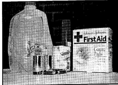
A few essentials to have around for when the storms roll in.

It's also a good idea to identify ahead of time where you could go if told to evacuate. Choose several places, such as a friend's home in another town, a motel or a shelter. Keep those telephone numbers handy, as well as a road map of your locality in case major roads