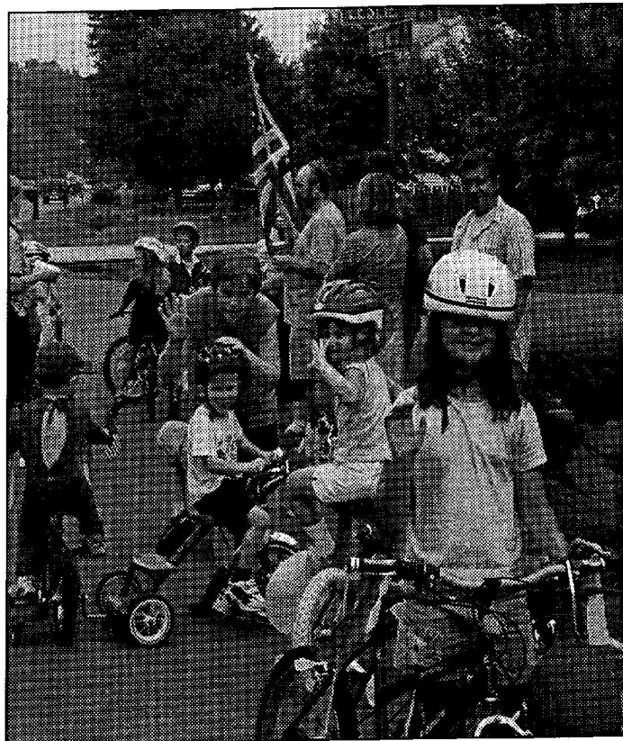
Youngsters turned out in full force to show their American pride during the second-annual Leslie Lane Memorial Day parade. There were 16 children and 14 adults out.