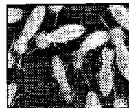
What a bunch of pests! York County landfill ASAP.

plastic edging or perhaps even river rock, which also don't deteriorate as fast. Take those timbers - and the termites - to the York County landfill ASAP.