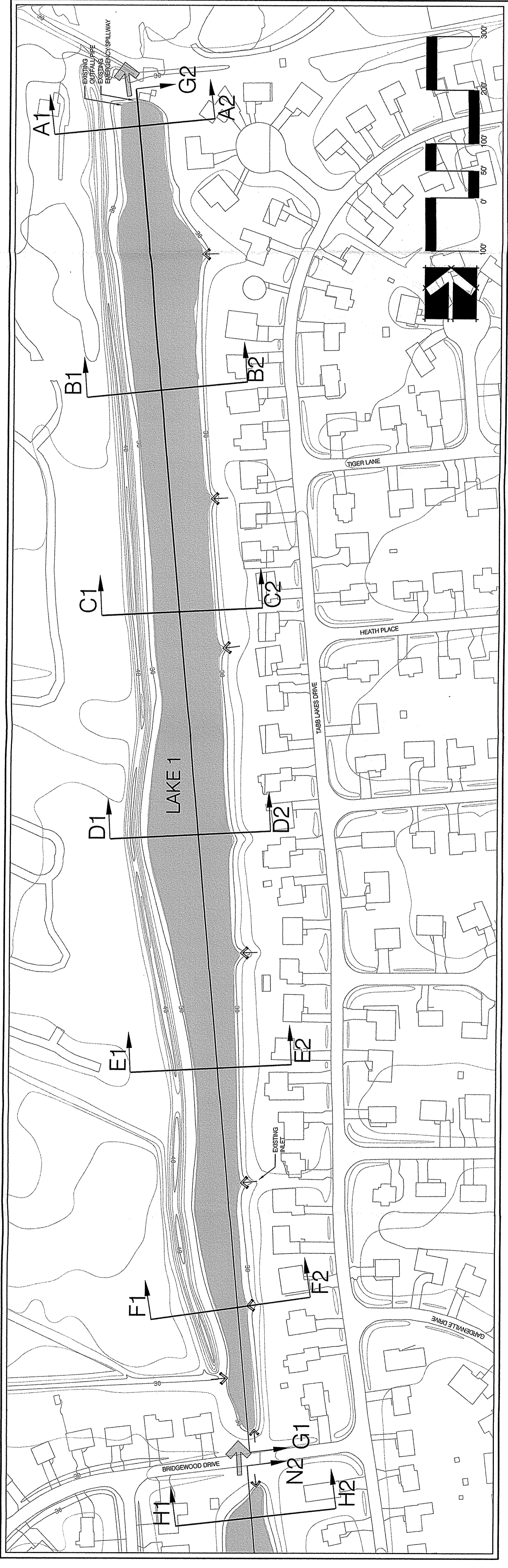
PLAN VIEW: LAKE 1 SCALE: 1" = 100'